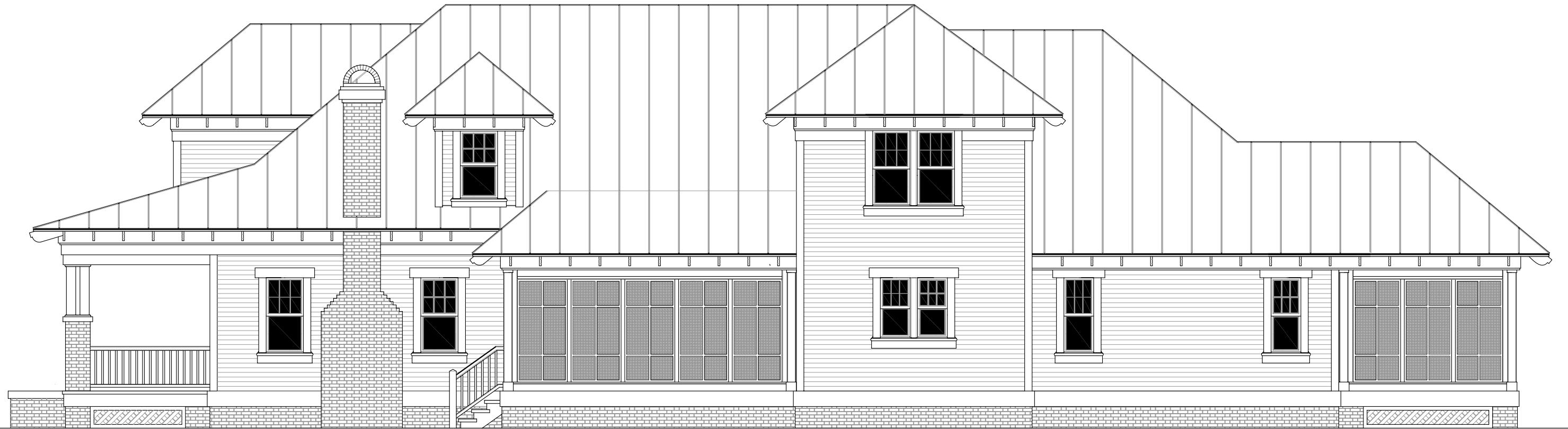
MAYOR'S HOUSE, RIGHT ELEVATION, FACING