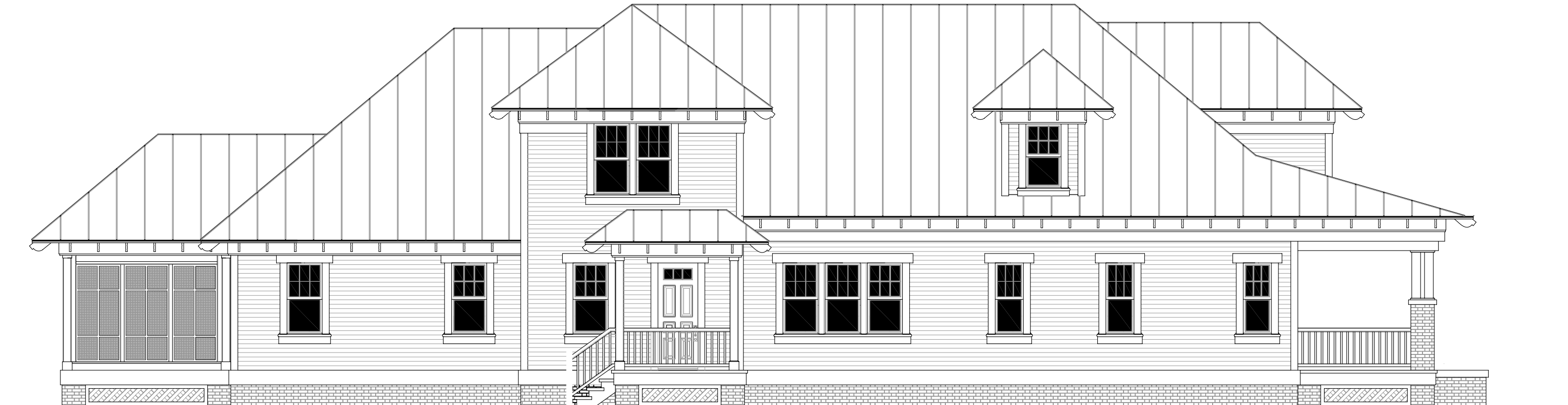
MAYOR'S HOUSE, LEFT ELEVATION, FACING