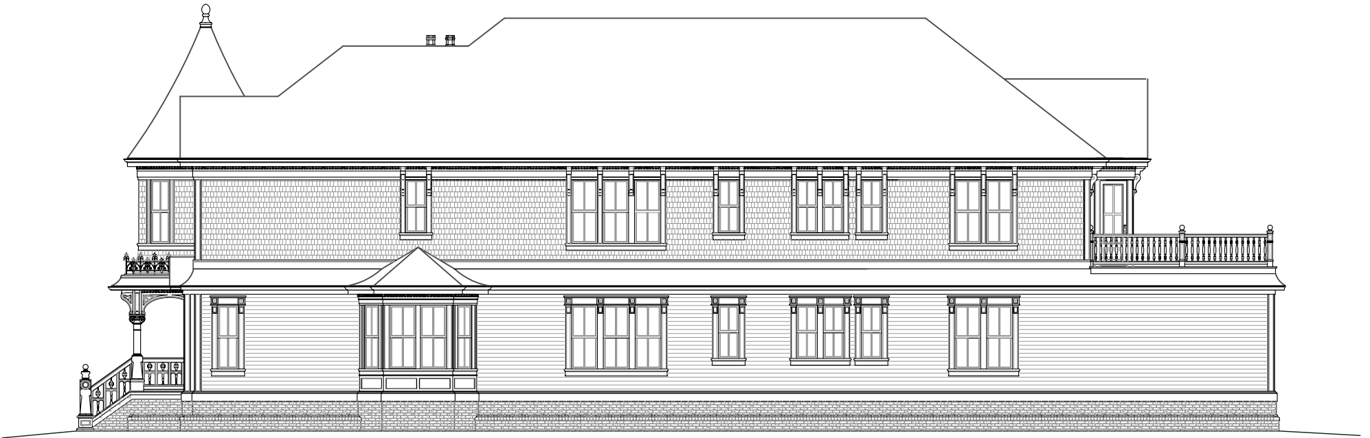
LAURA DUPLEX, RIGHT ELEVATION, FACING