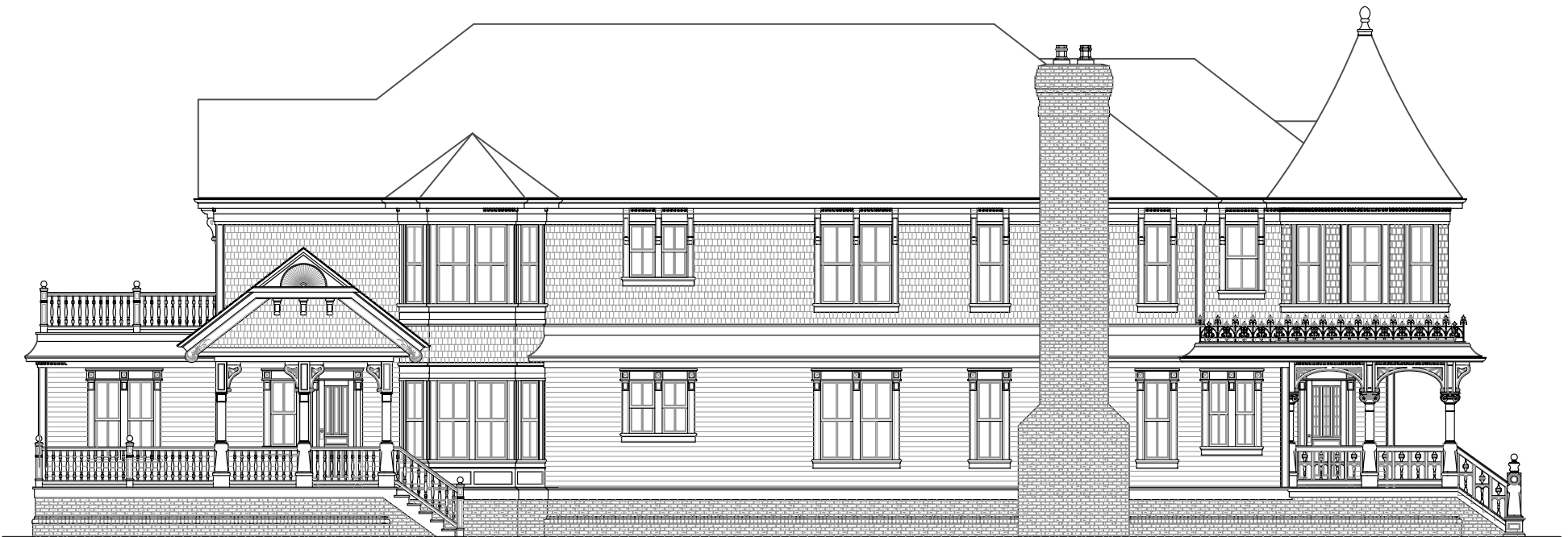
LAURA DUPLEX, LEFT ELEVATION, FACING