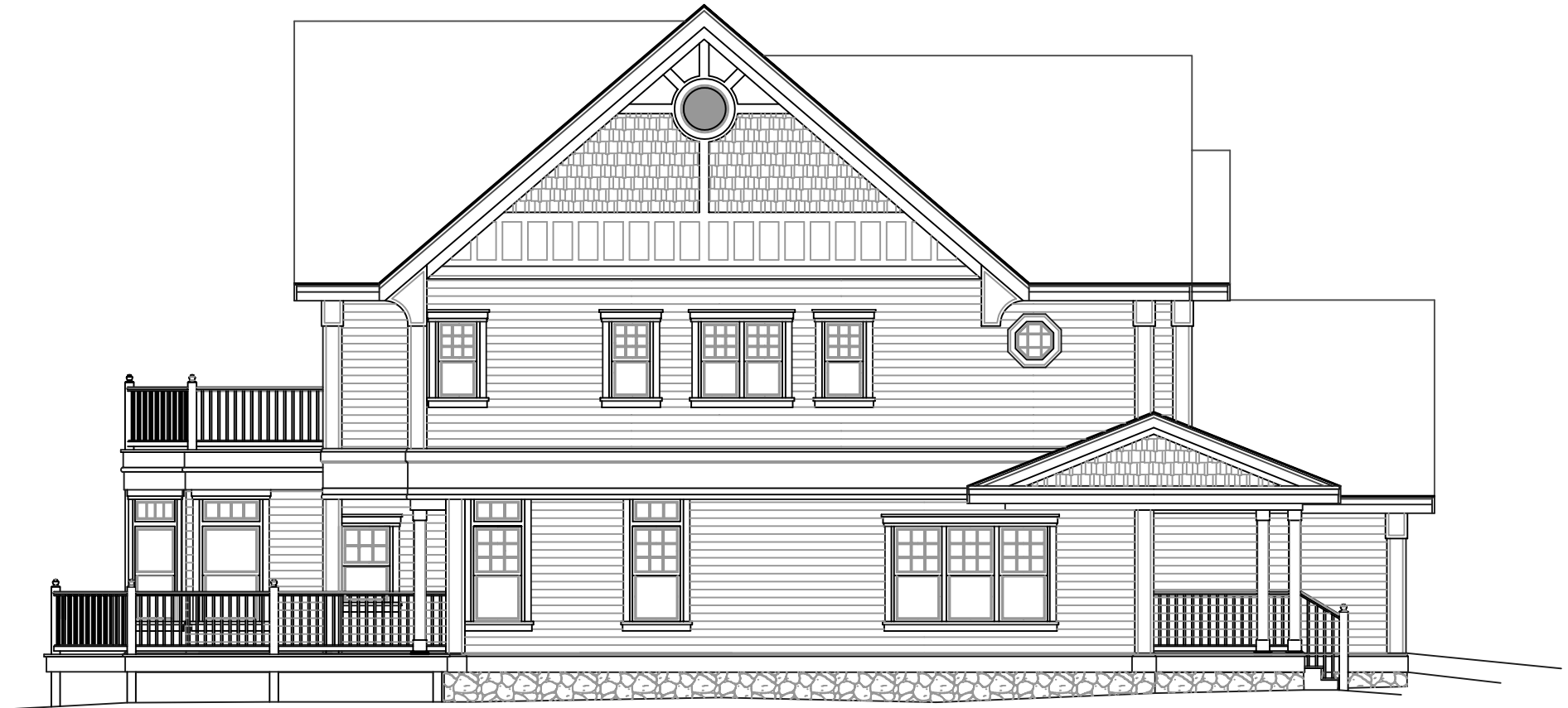
GOWAN STREET, LEFT ELEVATION, FACING