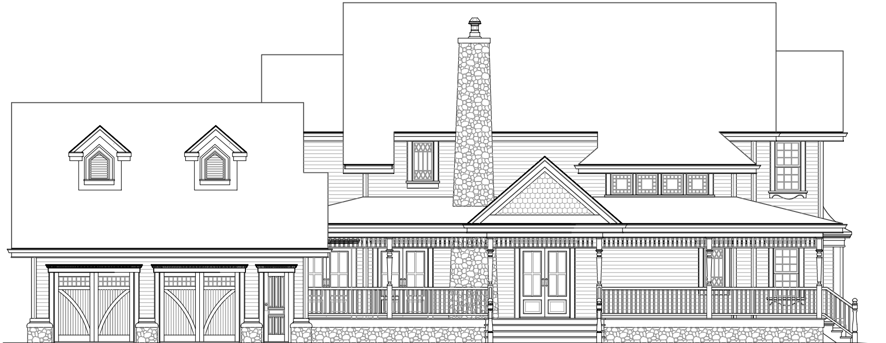
THE GIANELLA, LEFT ELEVATION,, FACING