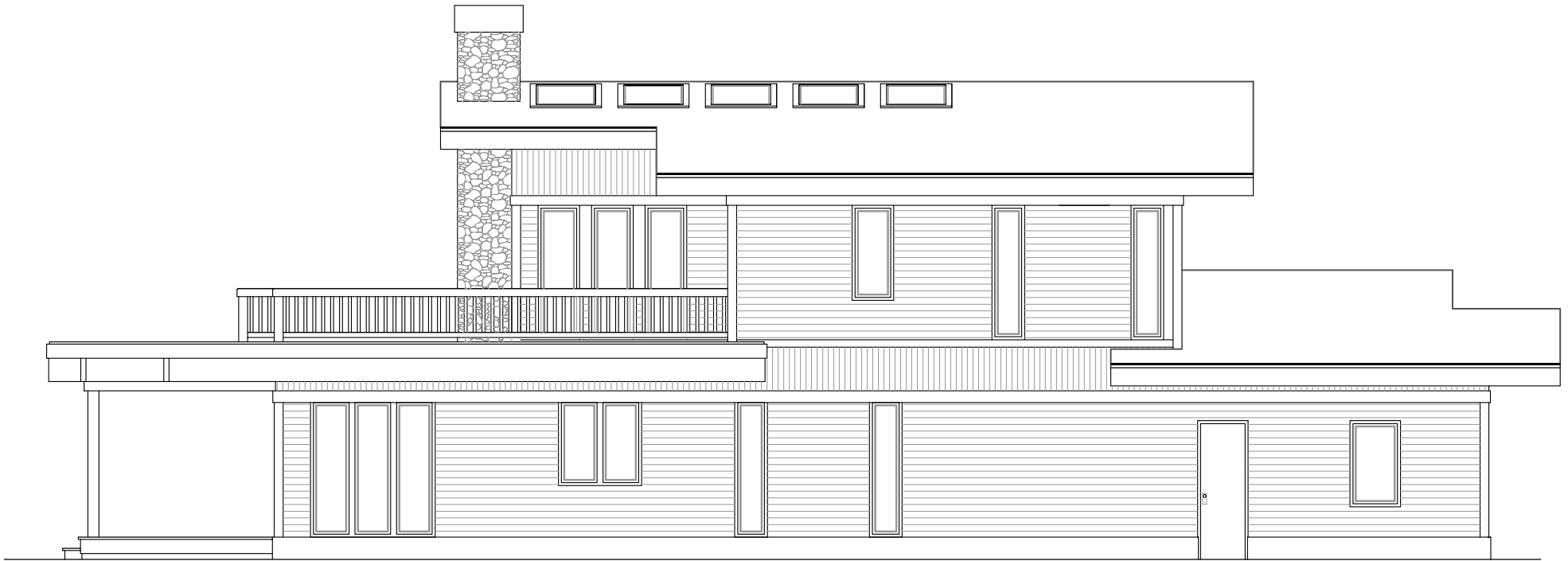
EICHLER 2, RIGHT ELEVATION, FACING