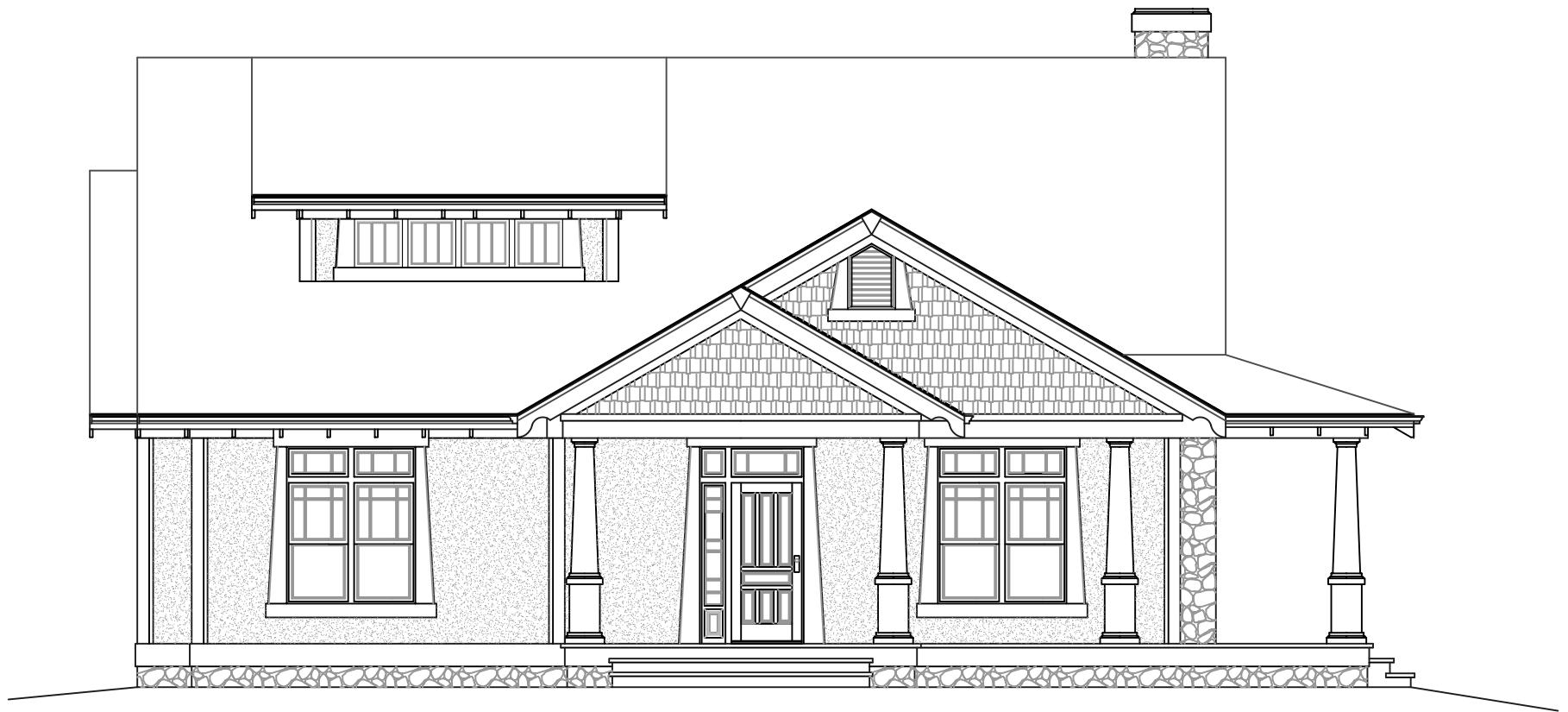
THE DUDDINGTON, FRONT ELEVATION