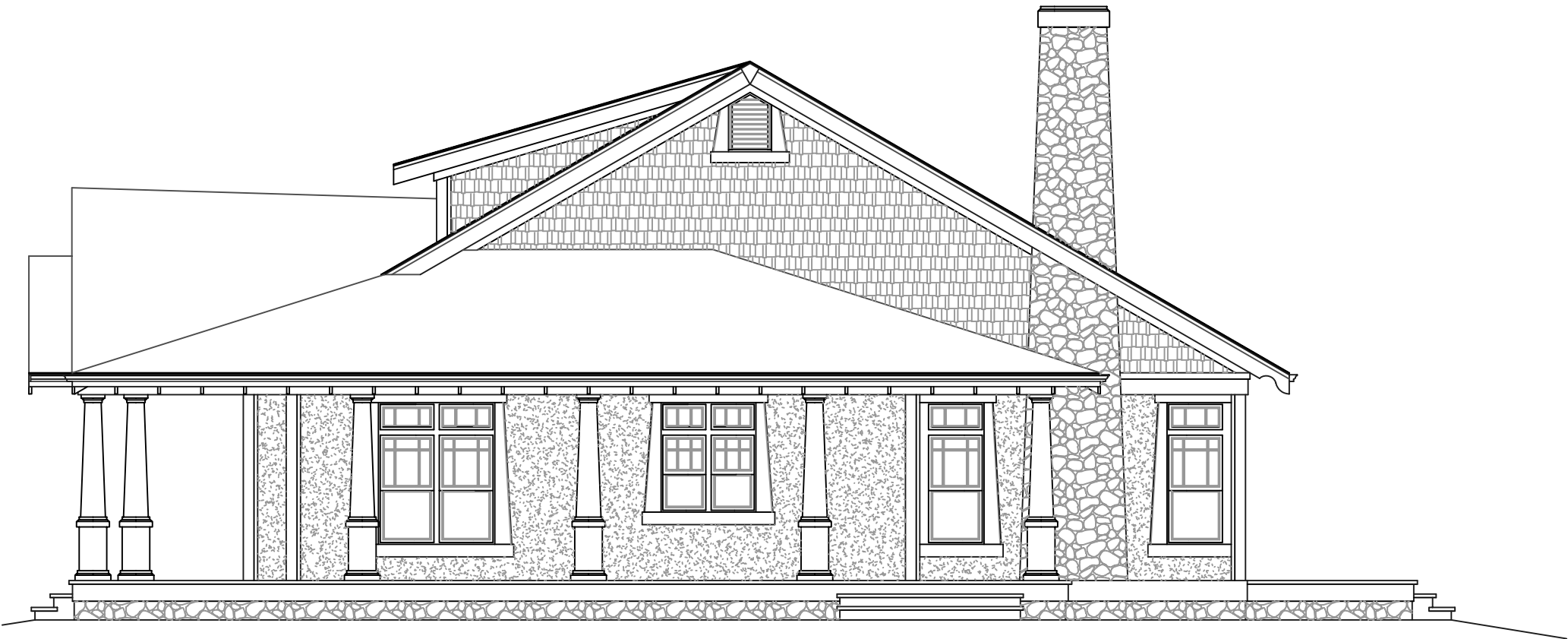
THE DUDDINGTON, RIGHT ELEVATION, FACING