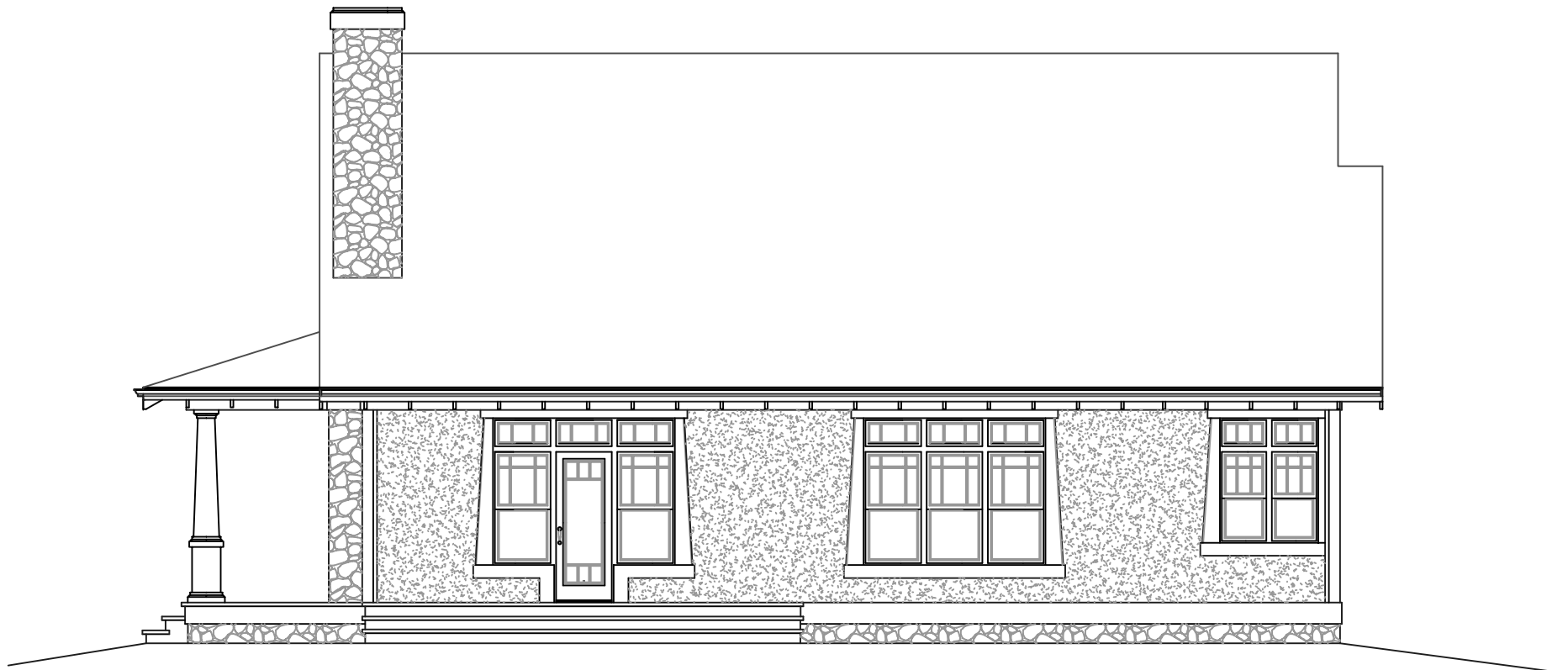
THE DUDDINGTON, REAR ELEVATION