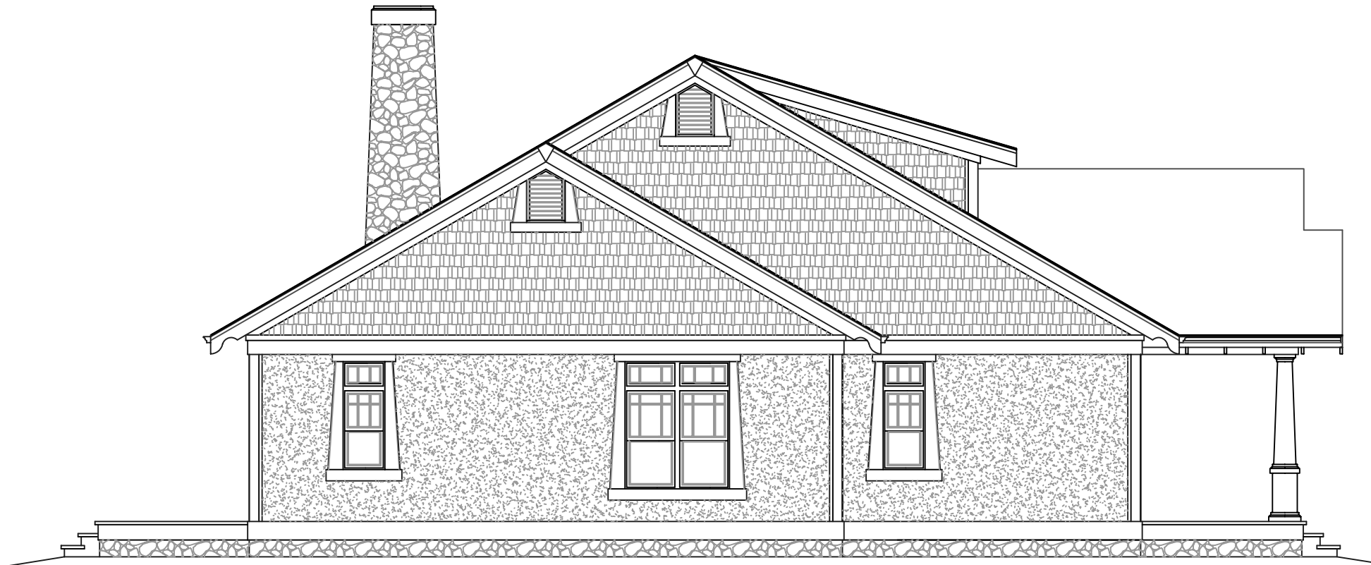
THE DUDDINGTON, LEFT ELEVATION, FACING