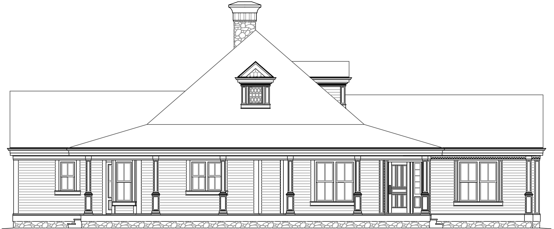
CAPE MAY 1, LEFT ELEVATION, FACING