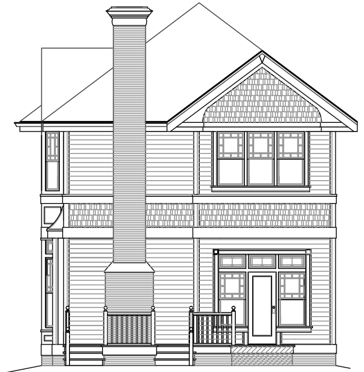
ANNANDALE, LEFT ELEVATION, FACING