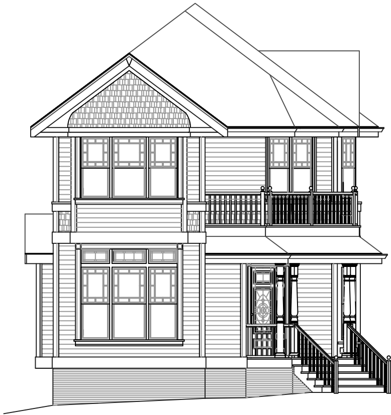
ANNANDALE, RIGHT ELEVATION, FACING