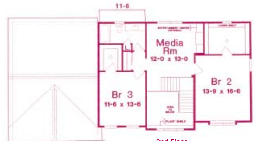
2nd Floor 25'7" / 26'9" / 27'6" x 38'9"