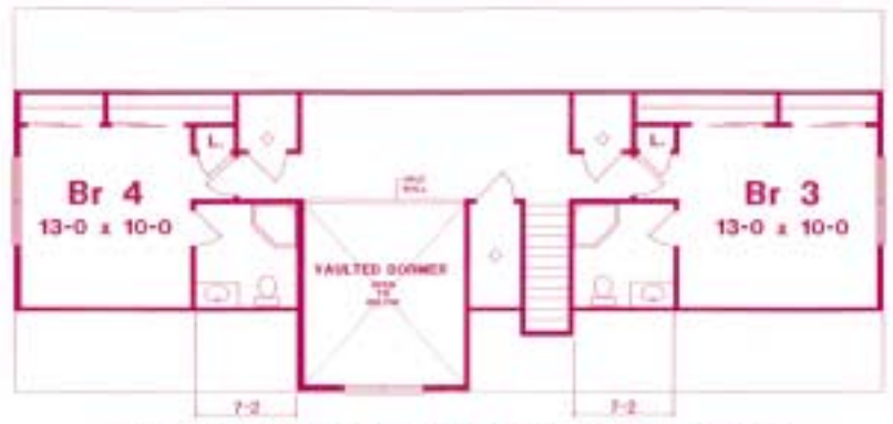
Suggested 2nd Floor Bonus Area 936 Sq. Ft.